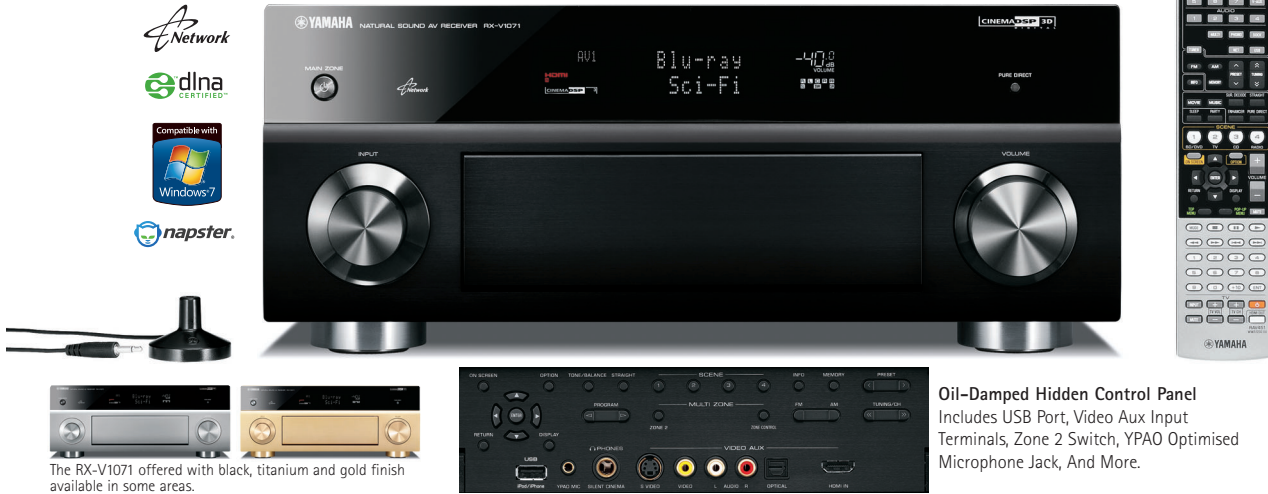
The RX-V1071 offered with black, titanium and gold finish available in some areas.

Supports HD audio and video sources, 8 in/2 out HDMI incl. 1 front panel input, Multipoint YPAO, SCENE PLUS, network functions incl. Web Browser Control via PC or PDA, AV Controller app compatibility, custom installation functions incl. Zone 2 Video.